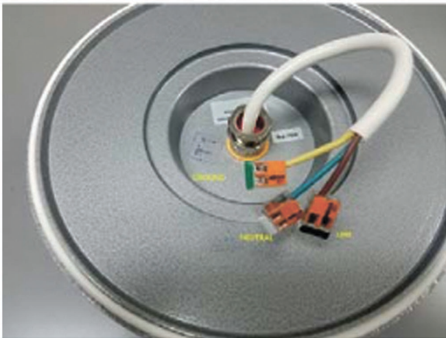
FIG 1. RETRUS™ FAMILY, 20-80W WIRING

PLEASE READ ALL INSTRUCTIONS CAREFULLY BEFORE BEGINNING THE INSTALLATION!